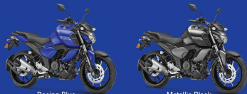
Racing Blue Metallic Black