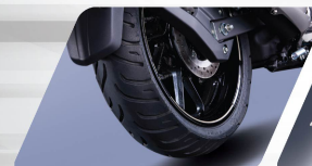
140mm Wide Radial Rear Tyre