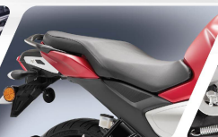
Two-level Single Piece Seat