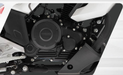
Durable 149cc Fuel Injection Engine