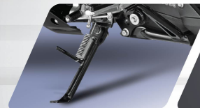
Side Stand Engine Cut-off Switch